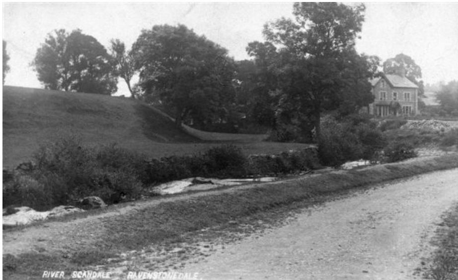
Scandal Beck before the Bowling Green

You are reminded that a period is set aside for members of the public to address the council at its meetings on matters of local interest or concern. It helps if those wishing to speak would notify the Clerk prior to the meeting.